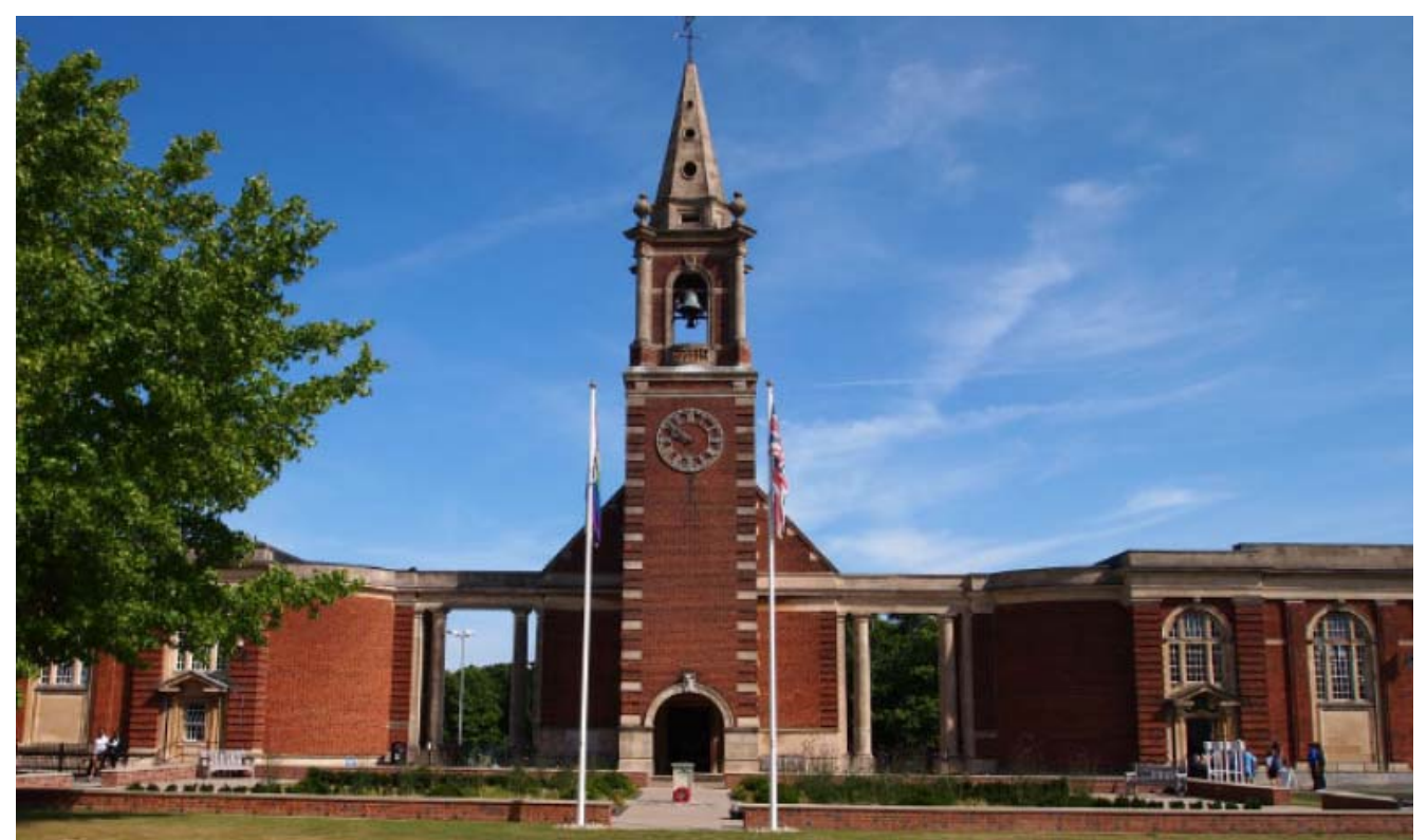
Figure 12: Rounded features to Chapel, with Great Hall to the left and Dining Hall to the right