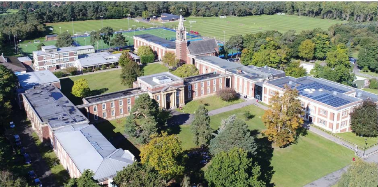
Figure 11: Main school campus built form