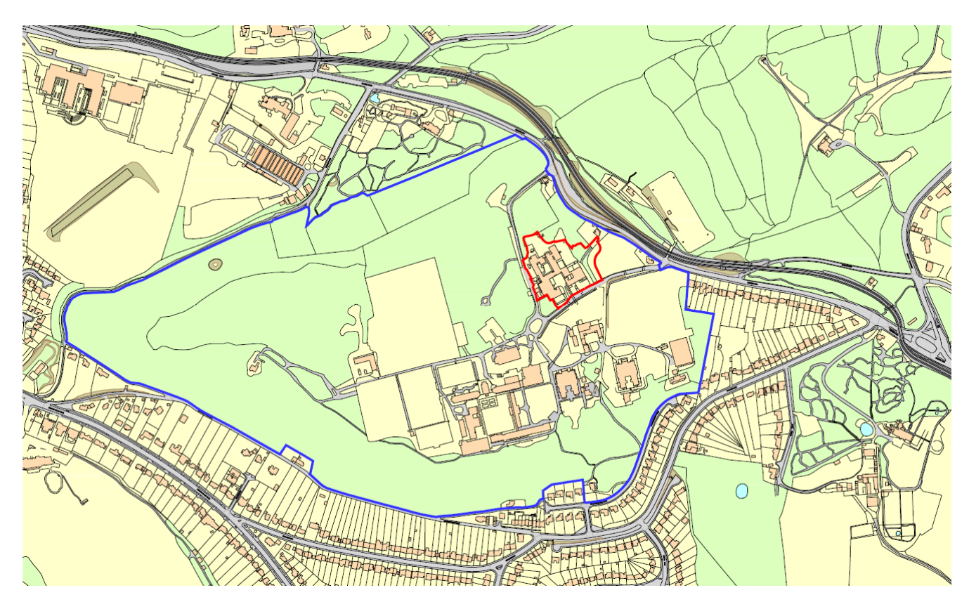
Figure 1: Site location plan