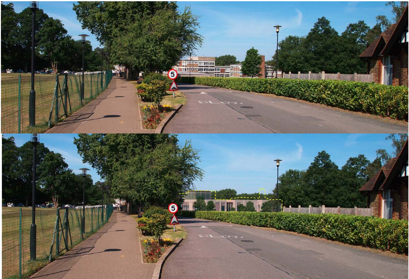
Figure 8: Comparative Photomontage - Approach Road View. Top image: Existing. Bottom image: Proposed

6.62 When viewed from the playground area to the west of the site (see Figure 9 below), it can be seen how the building steps down in level towards the woodland to the rear.