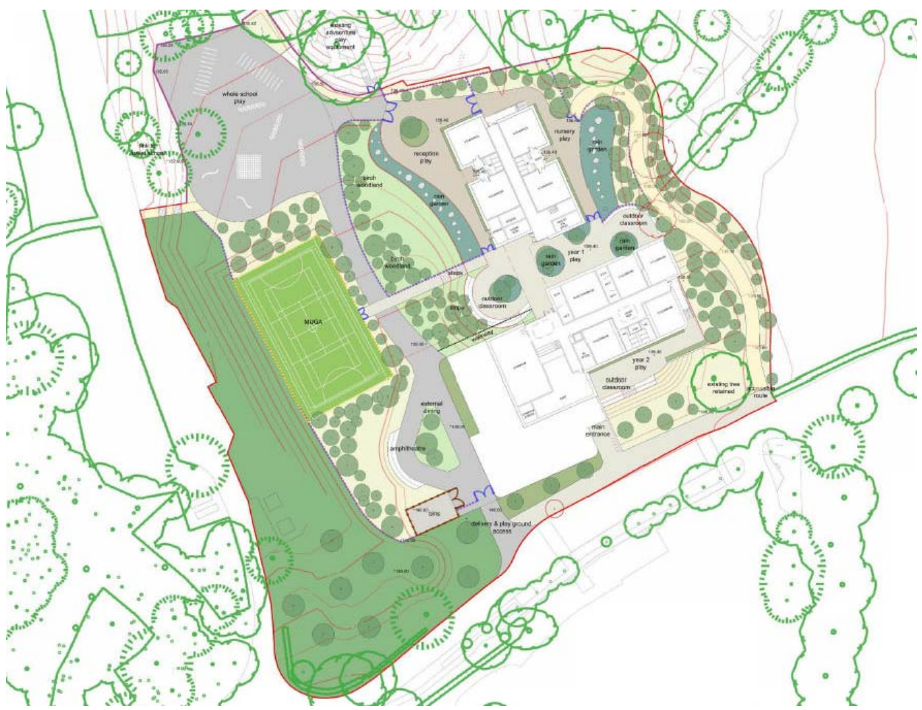
Figure 16: Illustrative landscaping masterplan