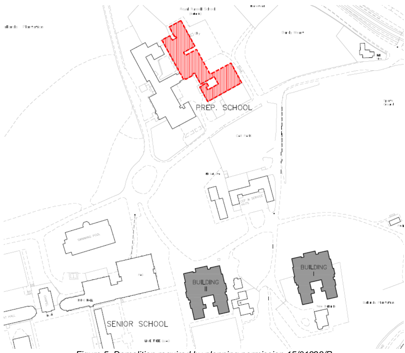
Figure 5. Demolition required by planning permission 15/01323/P

6.9 Planning permission was granted in 2015 (reference 15/01323/P) for the construction of two three-storey buildings to provide replacement residential student accommodation. In order to justify the development of these buildings in terms of the impact on the openness of the Metropolitan Green Belt, Condition 8 of that permission required partial demolition of some of the buildings on the Junior School site. Figure 5 below shows the extent of the existing structures to be demolished (shaded in red), which amounts to a total footprint of 1792sqm (referred to as Queens House).