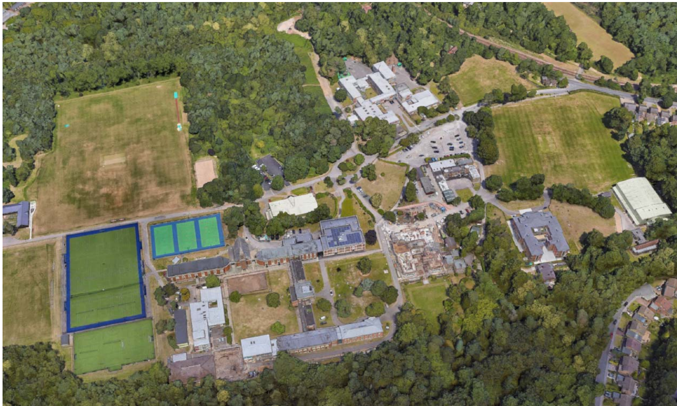
Figure 2: Aerial view of the Royal Russell School campus