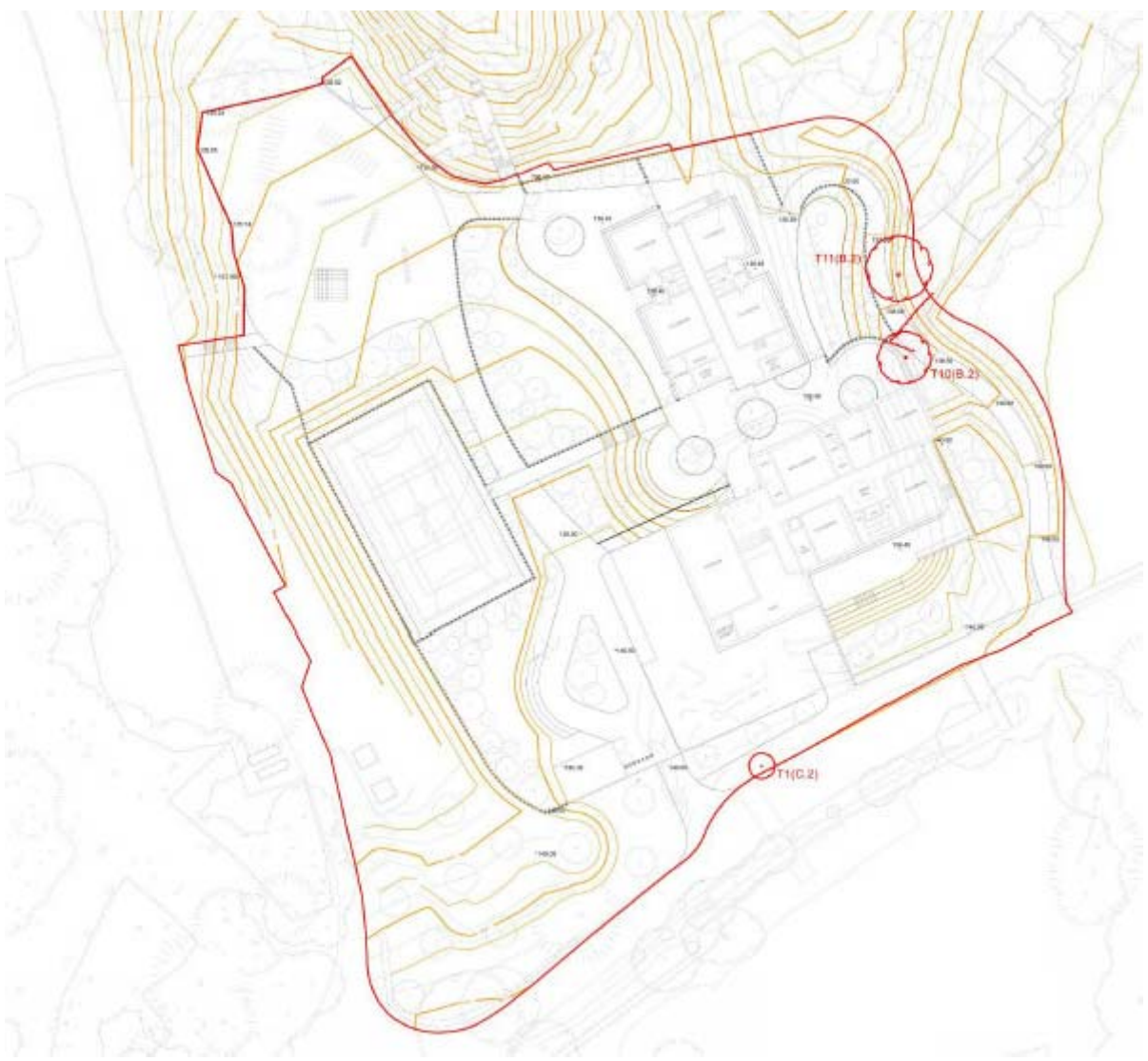
Figure 15: Potential tree Removals

gradient (i.e. as a result of required level changes). Officers share concerns over the removal of mature trees, and whilst the applicant intends to plant new trees across the development, officers expect that retention or relocating of the trees should be explored in the first instance, which is currently not evidenced.