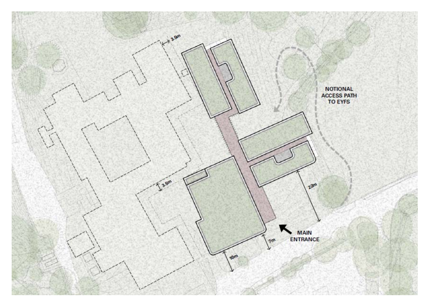
Figure 6: Proposed site layout

setting in terms of height and presence. Whilst the siting of the proposed building has largely remained in a similar position throughout the pre-application process, its massing and form have been significantly altered, to reduce the height of the structure and to create a building that responds to the nature topography of the site.